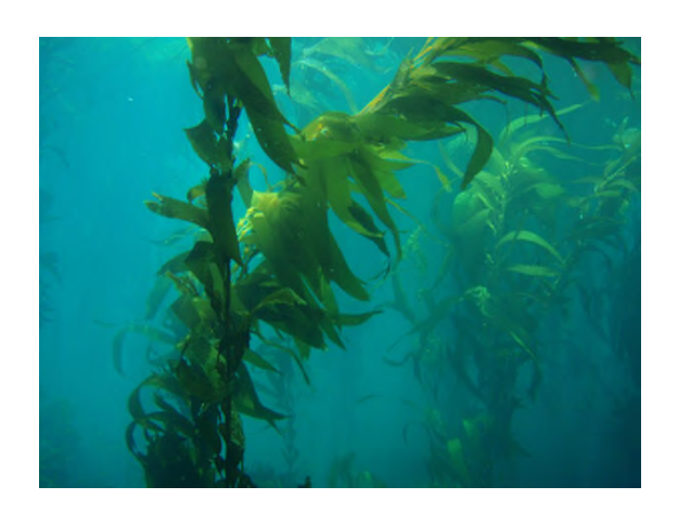
Macrocystis pyrifera, which is commonly called giant kelp or bladder kelp.

Researchers at Stony Brook University in southeastern New York say their studies show that the presence of kelp, already recognized as a nutritious food source for people and marine life, significantly reduces ocean acidification, which is a result of climate change.