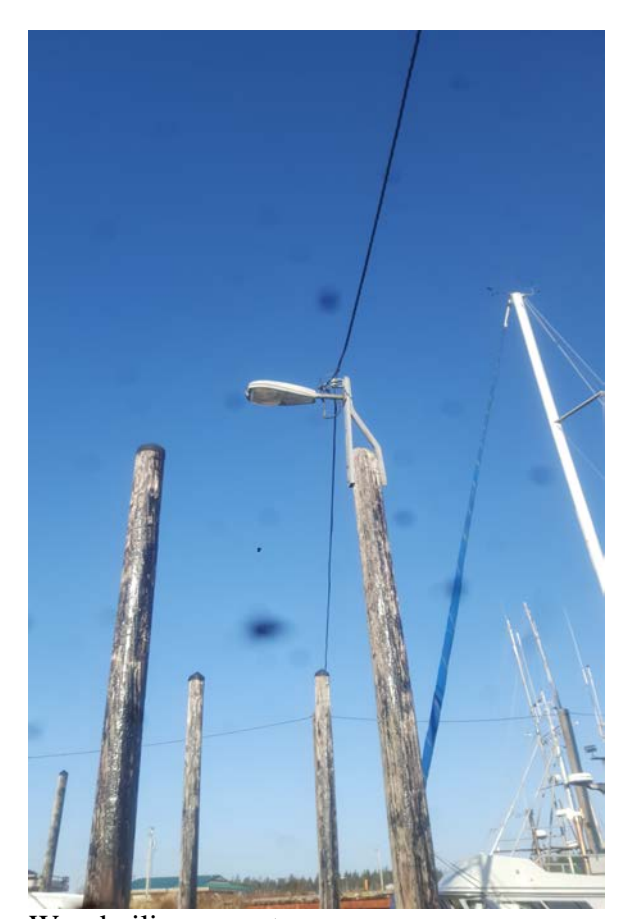
Wood piling mount.